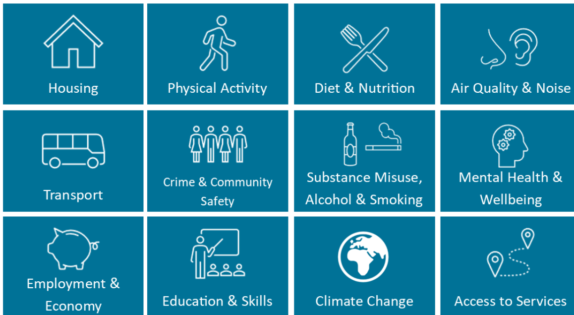
Figure 1: Darlington's 12 HIA Assessment Themes

The HIA process needs to begin late enough in a proposal's development to be clear about the proposal's nature and purpose, but early enough to influence its design and implementation, and well before any plans are submitted as part of a planning application. Please ensure this process is evidenced as part of the summary report.